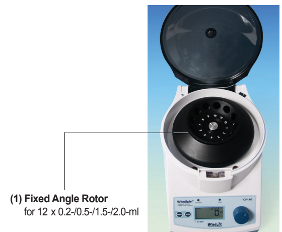
(1) Fixed Angle Rotor for 12 x 0.2-/0.5-/1.5-/2.0-ml