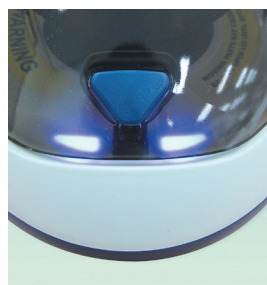
Operation Display LED Lamp