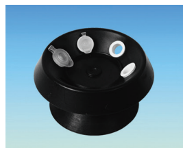
(1) Circular Fixed Angle Rotor For 6 x 0.2-/0.5-/1.5-/2.0-ml Tubes