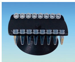
(2) Fixed Strip Rotor For 2 x 0.2ml PCR 8-tube Strips or 16 x 0.2ml PCR Tubes