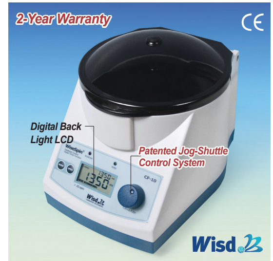
High Performance Pro-microcentrifuge Set "CF-10"

DH.WCF00300 0.5ml Tube Adapter-sets, 12ea Adapter/1set, for Fixed Angle Rotor, "CFTA2"