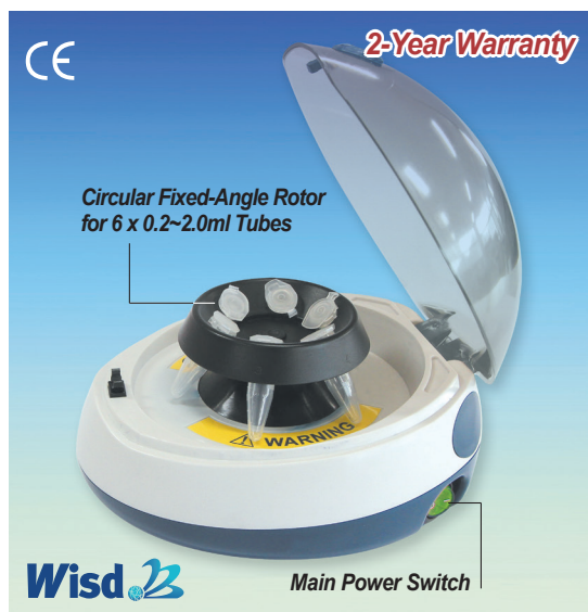
Mini-microcentrifuge Set "CF-5" with Circular Fixed Angle Rotor

witeg® High performance Mini-microcentrifuge Set, "CF-5", Max. 5,500 rpm, GMP Certi., with Certi. & Traceability with Circular Fixed-Angle Rotor for 6 x 0.2/0.5/1.5/2.0 ml Tubes and Strip Rotor for 2 x 0.2ml PCR 8-tubes Strips/ 16 x 0.2ml PCR Tubes