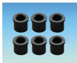
(3) Tube Adapter 6 x 0.2 -/ 0.5-ml Tube Adapter